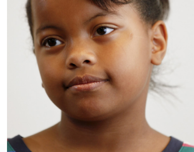
ACUTE LEUKEMIA TREATMENT